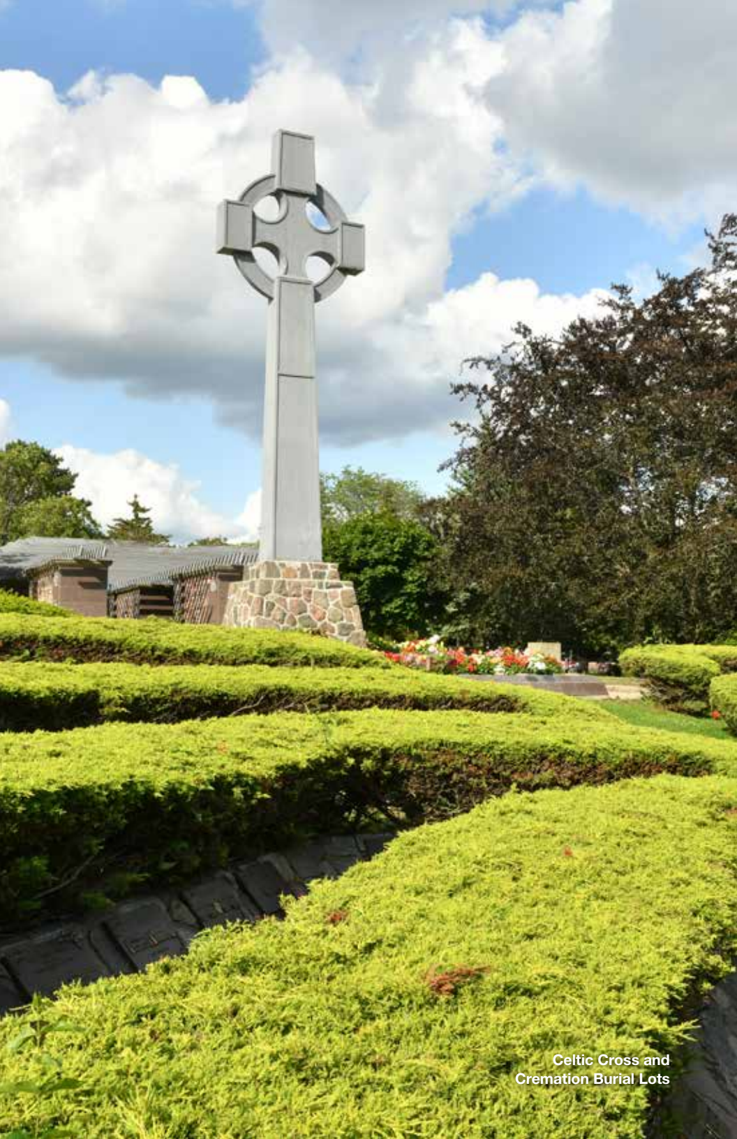
Celtic Cross and Cremation Burial Lots