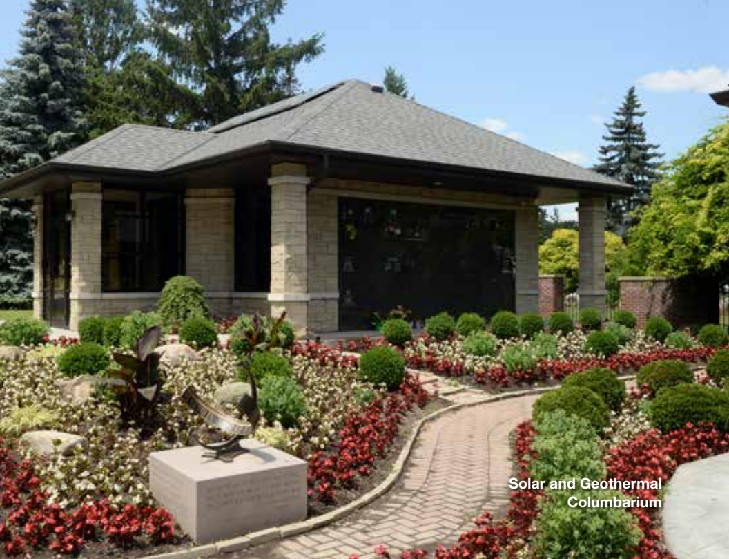
Solar and Geothermal Columbarium