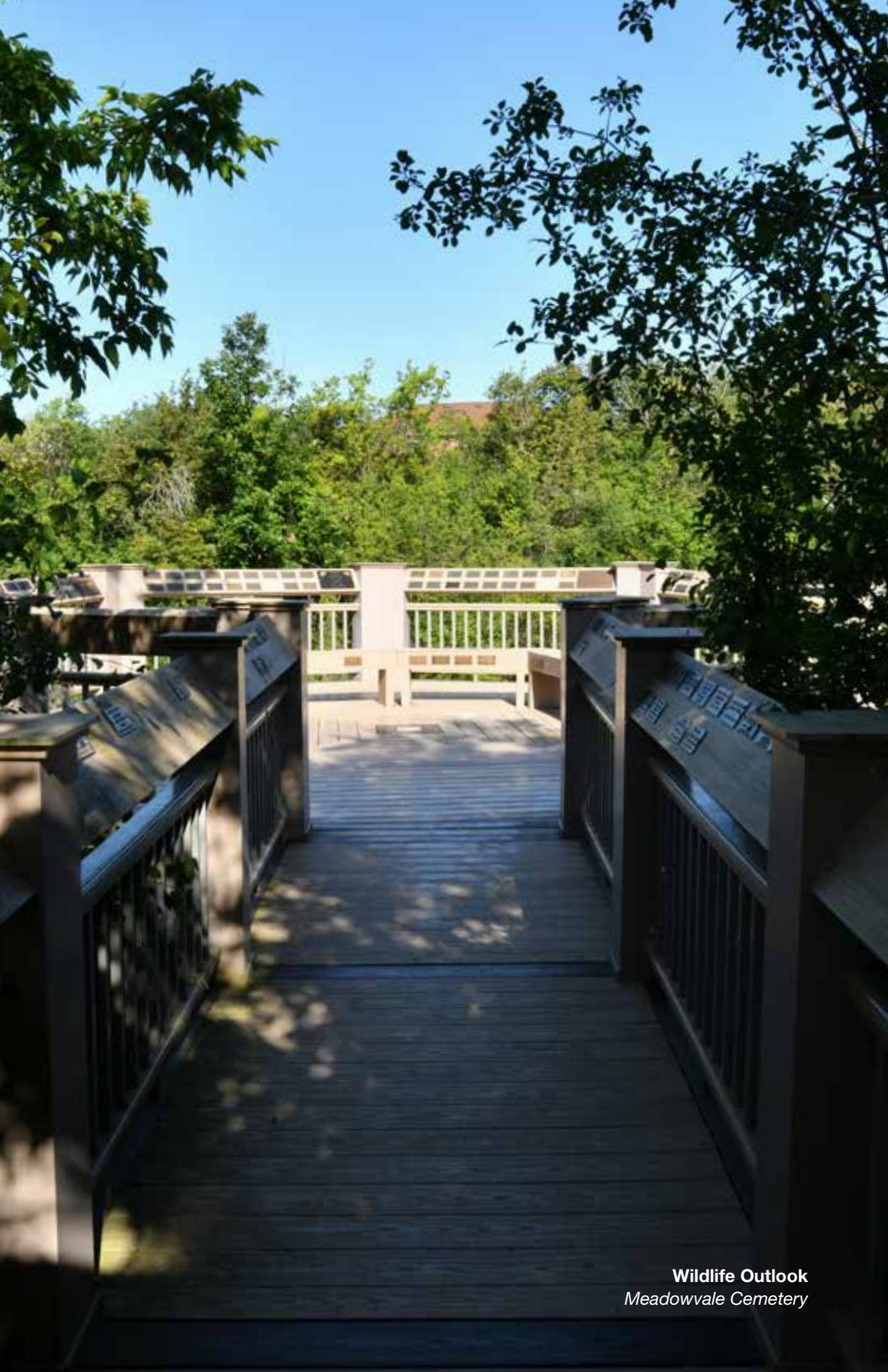
Wildlife Outlook Meadowvale Cemetery