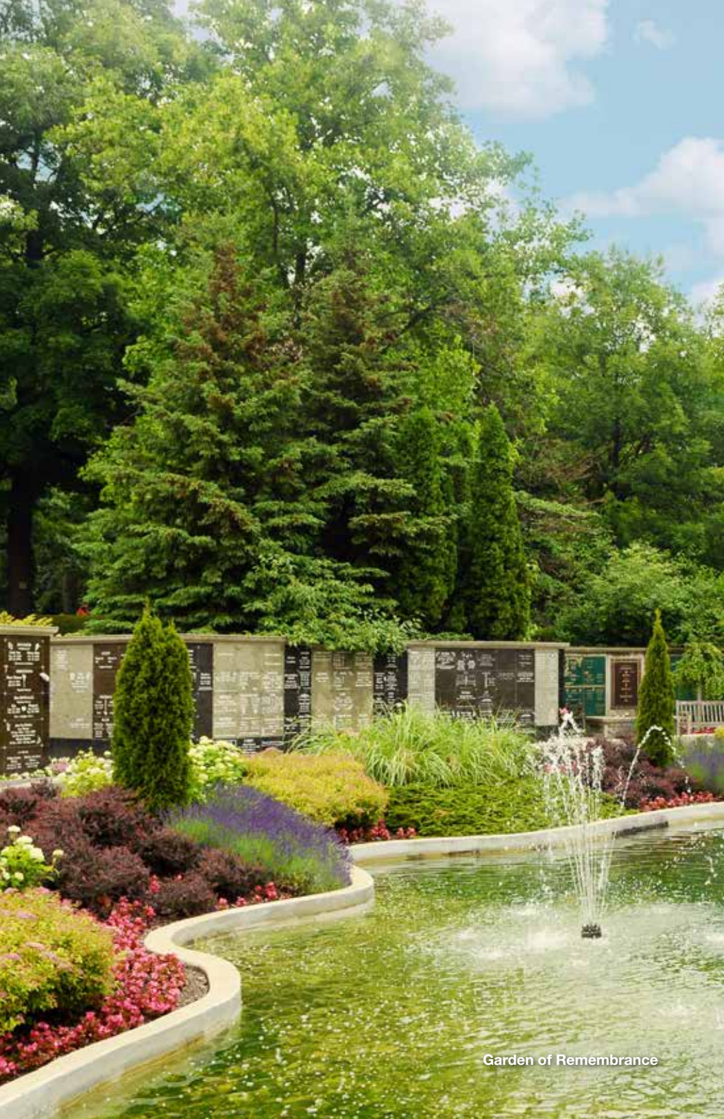
Garden of Remembrance