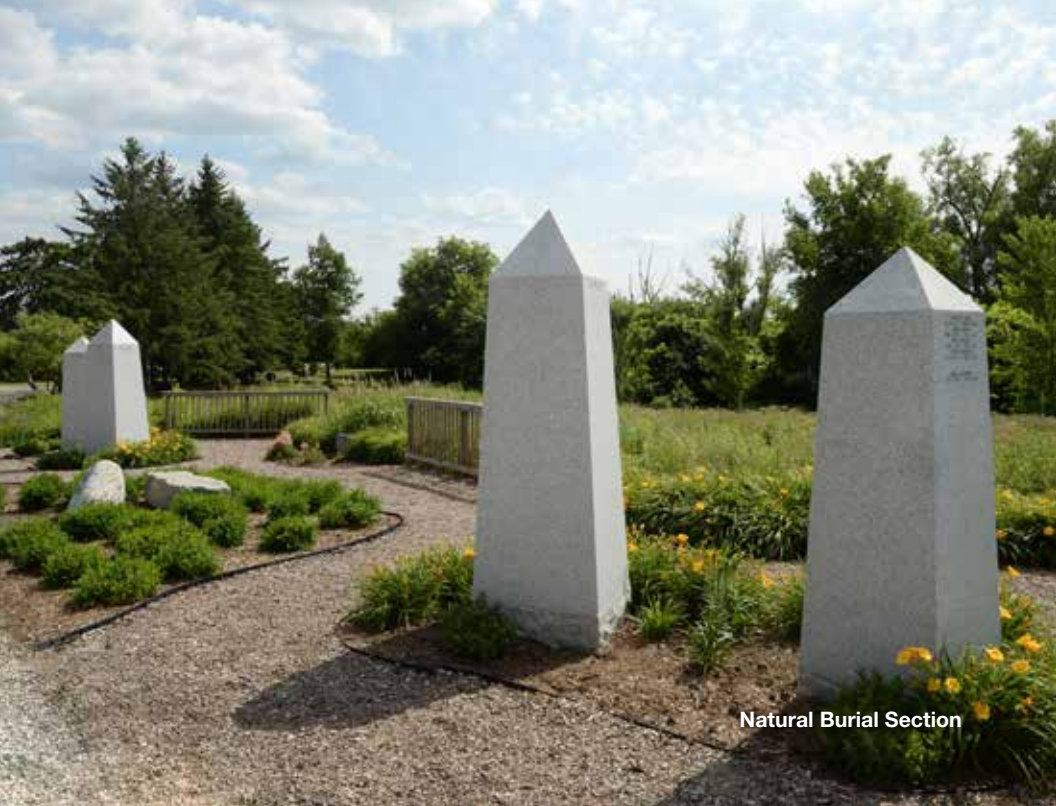
Natural Burial Section