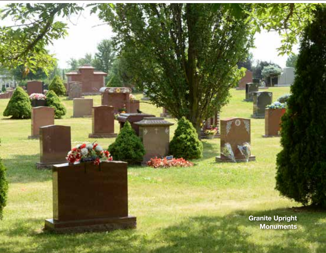
Granite Upright Monuments