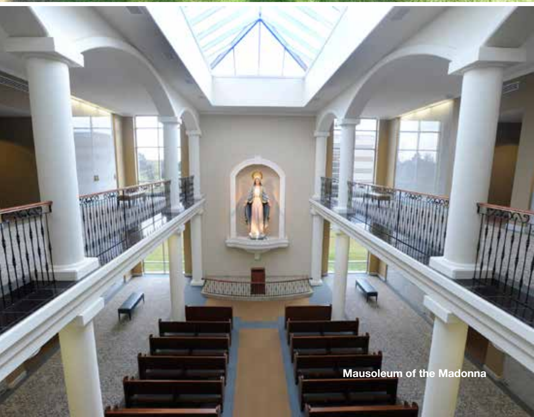
Mausoleum of the Madonna