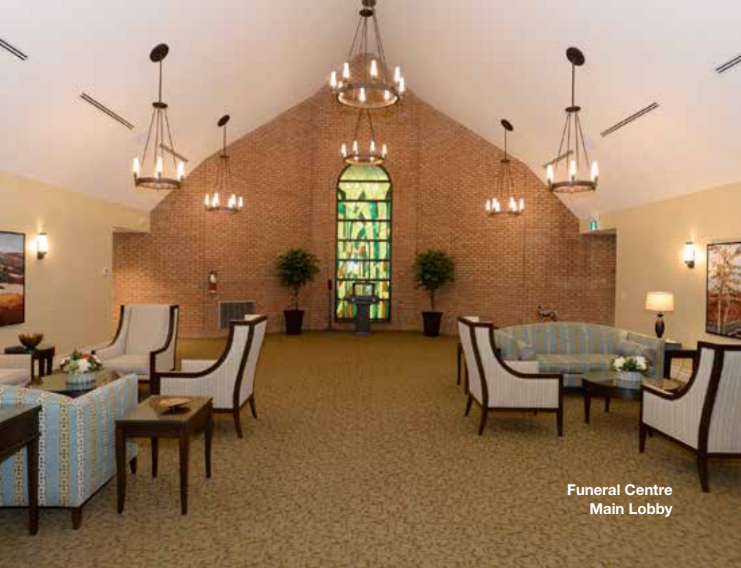
Funeral Centre Main Lobby