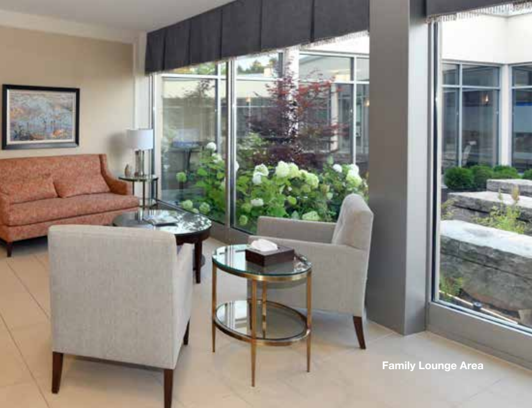
Family Lounge Area