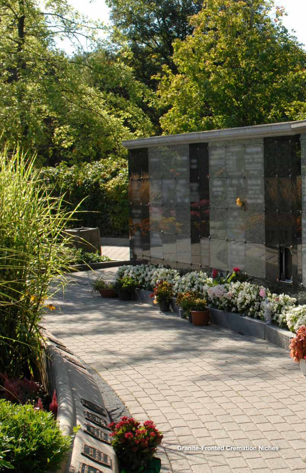
Granite-Fronted Cremation Niches