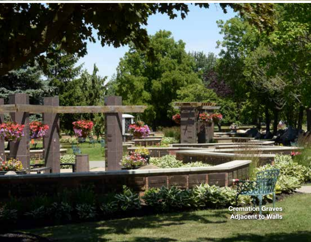
Cremation Graves Adjacent to Walls