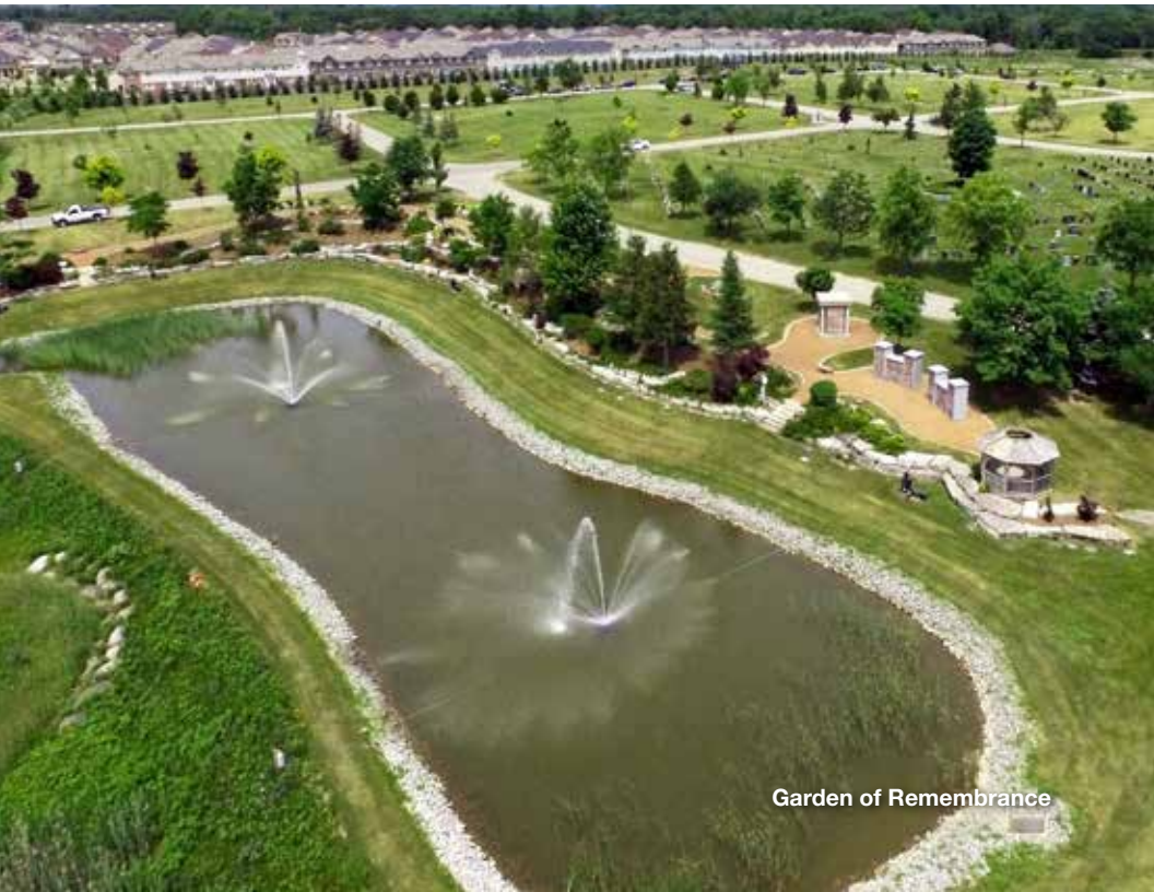
Garden of Remembrance