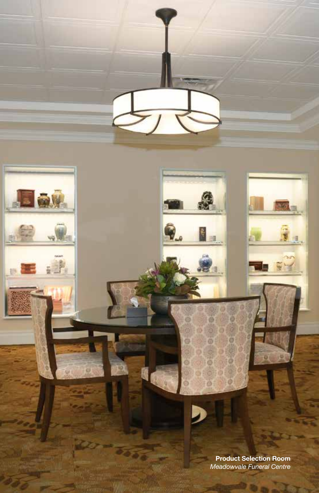
Product Selection Room Meadowvale Funeral Centre