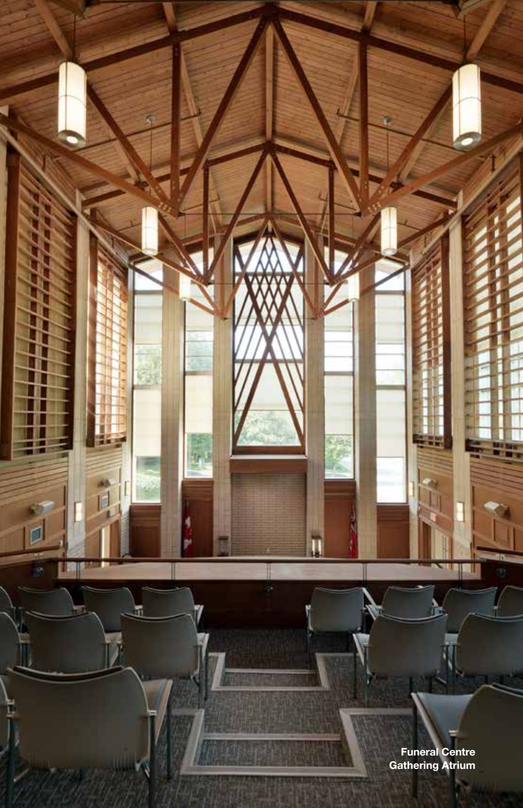
Funeral Centre Gathering Atrium