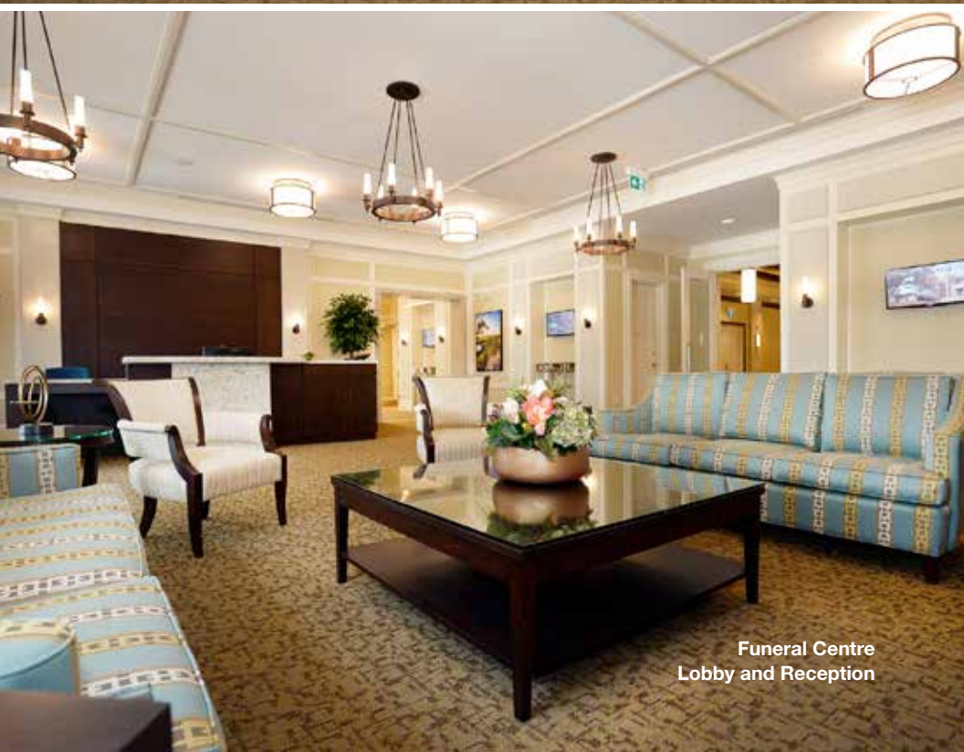
Funeral Centre Lobby and Reception