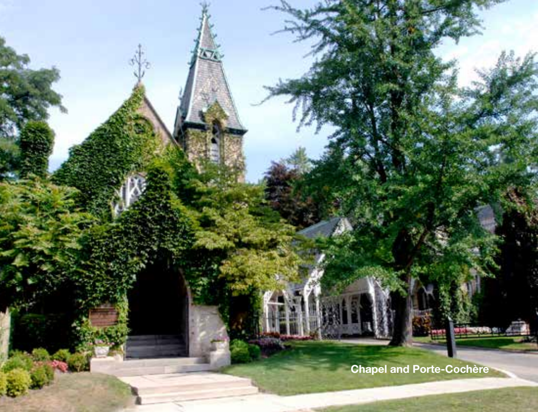
Chapel and Porte-Cochère