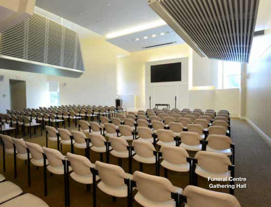
Funeral Centre Gathering Hall